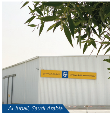
Al Jubail, Saudi Arabia

Oil & Gas • Refining • Pipelines • Petrochemicals • Chemicals Power • Paper & Pulp • Mining & Metallurgy • Water • HVAC Process Industries • Utilities • Defence & Aerospace